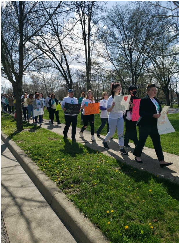
PICTURED ABOVE: TAKE BACK THE NIGHT PARTICIPANTS