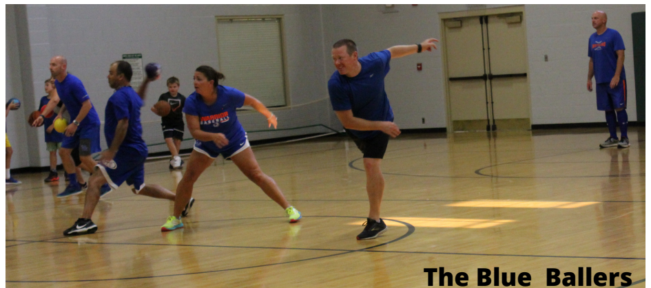
The Blue Ballers