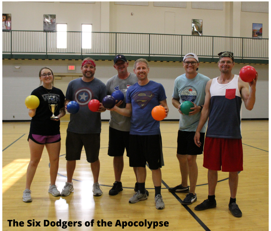
The Six Dodgers of the Apocalypse